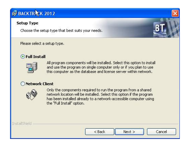
Figure 2-2 Setup Type - Full Install

6 On the Setup Type window click Full Install, and then click Next.