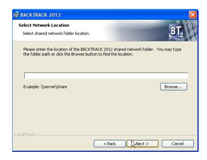
Figure 2-6 Select Network Folder Location

5 On the Select Network Location window, type the full UNC path located in the shared network folder: