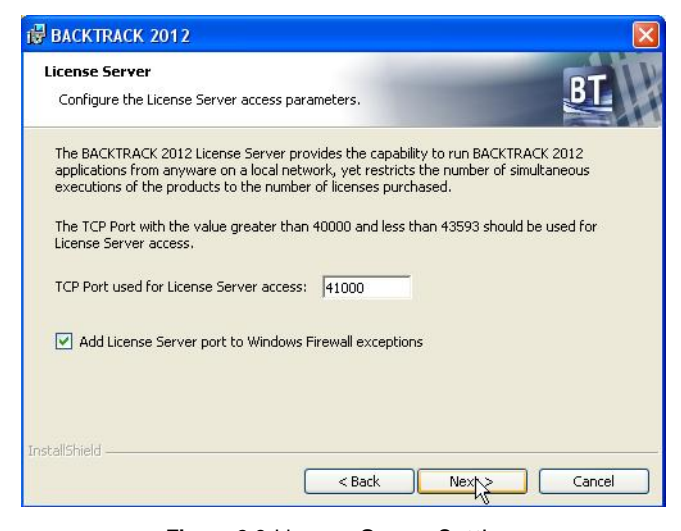
Figure 2-3 License Server Settings

Note: For Network Client installations, see the "Network Client Install" section on page 2-7.