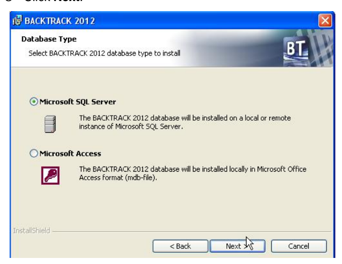
Figure 2-4 Select Database Type

9 On the Database Type window, select one of the following database types to be used as the structure for the BACKTRACK database.