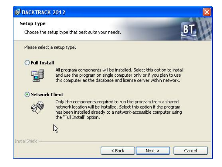
Figure 2-5 Setup Type - Network Client

4 On the Setup Type window, select Network Client, and then click Next.