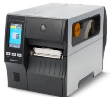
Zebra ZT411 Printer Model

Learn more about TEKLYNX + Zebra visit www.teklynx.com/zebra