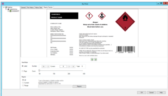
Reprint Labels That Have Previously Been Printed