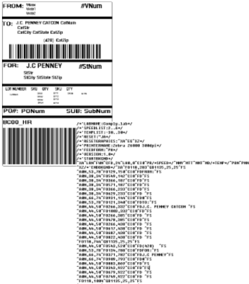
Figure 2: A CODESOFT label design file and a POF file exported from the label design.

The POF configuration is completely customizable.