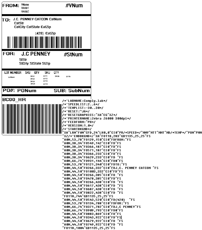
Figure 2: A CODESOFT label design file and a POF file exported from the label design.